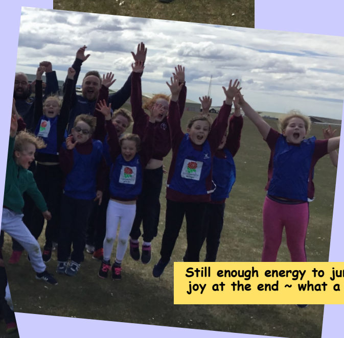
Still enough energy to jump for joy at the end ~ what a team.