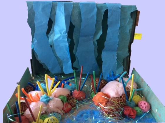
Alfie's coral reef habitat