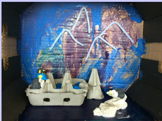
Fraser's Antarctic habitat