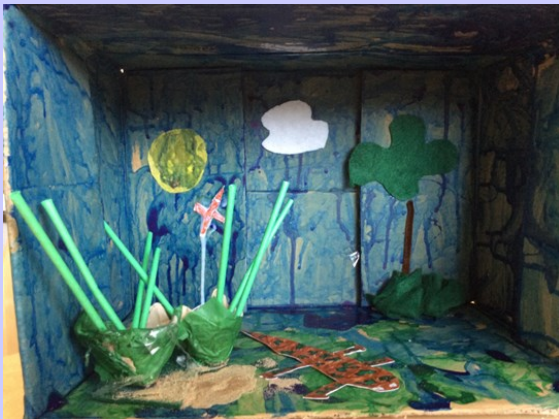
George's marshland habitat