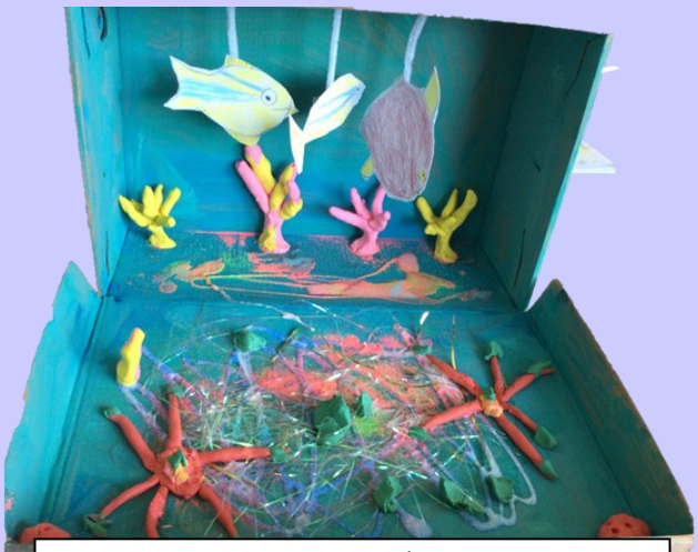
Siana's ocean habitat